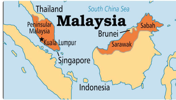
Main Map >