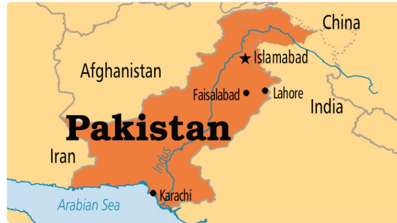
Main Map >